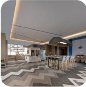
HOLIDAY INN EXPRESS

Soft decoration, fixed decoration, and activity furniture are all from HAOBOWEI