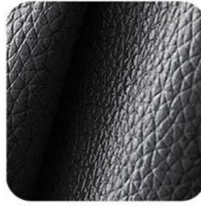
Top grain leather