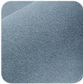
Full frosted leather