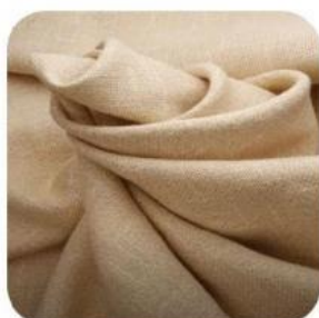
Cotton and linen cloth