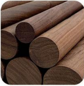
Black Walnut Wood