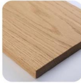
White oak Wood