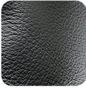
Full top grain leather