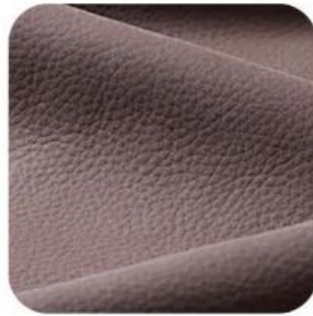
Lightly frosted leather