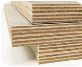
Solid Wood Multi-layer Board