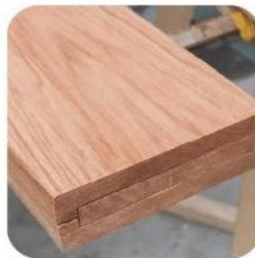
Red Oak Wood