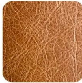
Waxed oil leather

*For more material details, please consult us