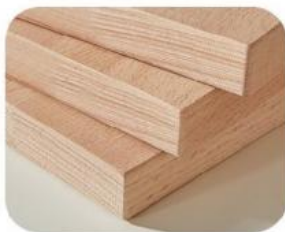
Solid Wood Board