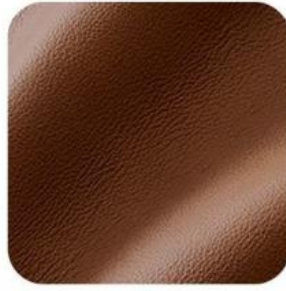
Semi top grain leather