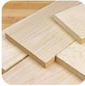
Hard Maple Wood