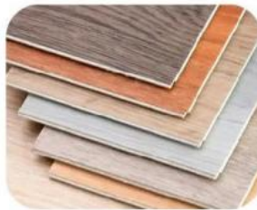
Decorative High-pressure Laminate