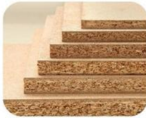
Solid Wood Particle Board