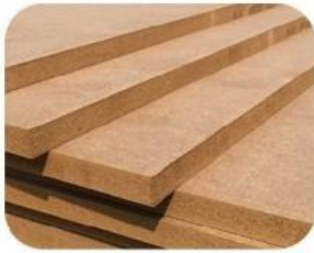
Medium Density Fiberboard