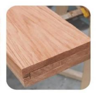
Red Oak Wood