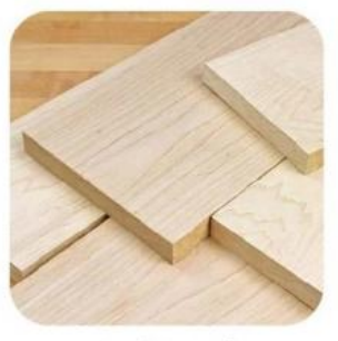
Hard Maple Wood