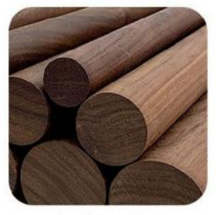
Black Walnut Wood