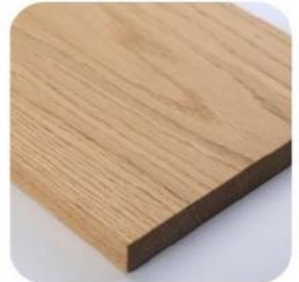
White oak Wood