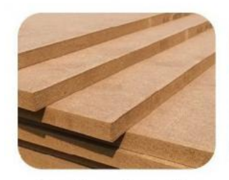
Medium Density Fiberboard