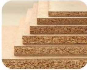
Solid Wood Particle Board