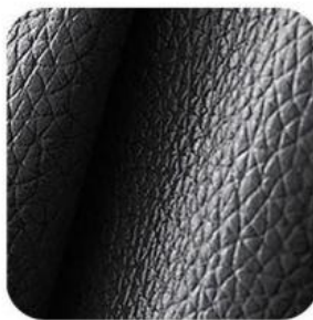
Top grain leather