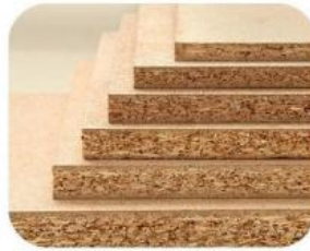
Solid Wood Particle Board