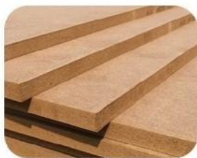
Medium Density Fiberboard