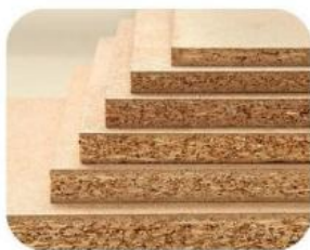
Solid Wood Particle Board