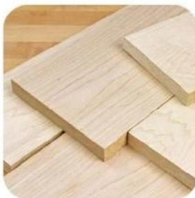
Hard Maple Wood