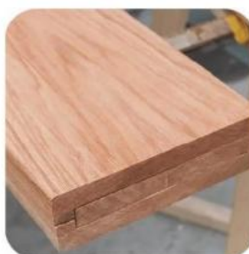
Red Oak Wood