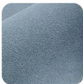
Full frosted leather