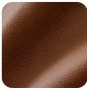
Semi top grain leather