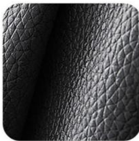
Top grain leather