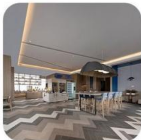
HOLIDAY INN EXPRESS

Soft decoration, fixed decoration, and activity furniture are all from HAOBOWEI