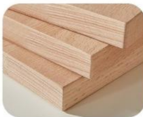
Solid Wood Board