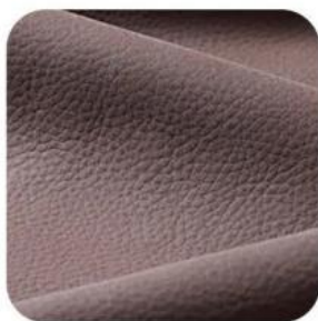
Lightly frosted leather