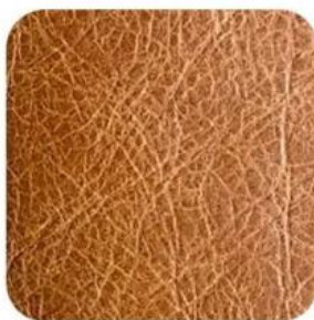
Waxed oil leather

*For more material details, please consult us