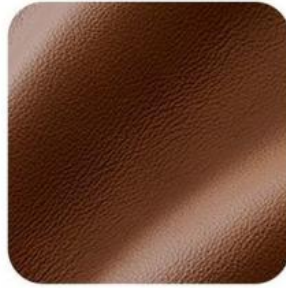
Semi top grain leather